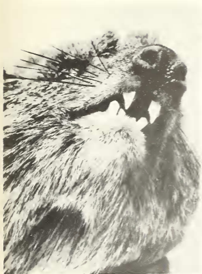
Plate Ia The incisor teeth of a male hyrax. The lower incisors of this old animal are worn down to peg-like stumps and are no longer comb-like.